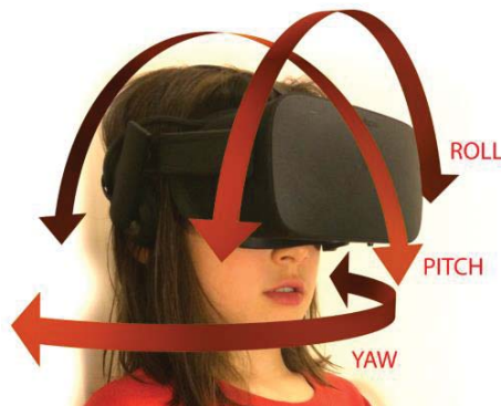
Figure 1. The child may move her head in pitch orientation, as in nodding her head, in yaw orientation, as in moving her head from side to side to look around the environment, or in roll orientation, as in touching her ear to her shoulder.

Tracking users' movements while they experience VR is a key factor in creating realistic and compelling scenarios [1]. Two kinds of tracking are used in VR: orientation and position. Orientation, shown in Figure 1, tracks the user's head movements and allows her to gaze around her virtual environment.